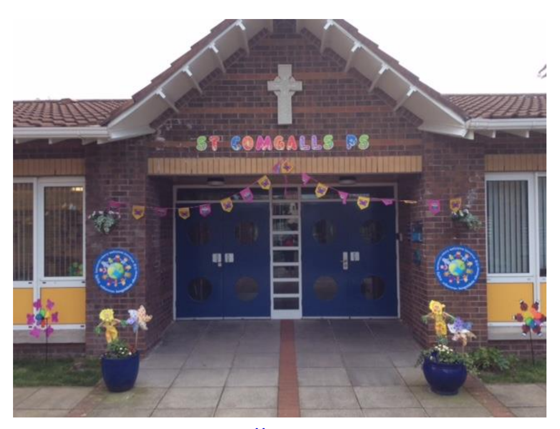
St Comgall's PS, Bangor Quality Learning, Friendship For All